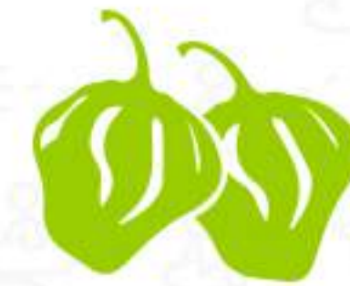
Scotch Bonnet Pepper