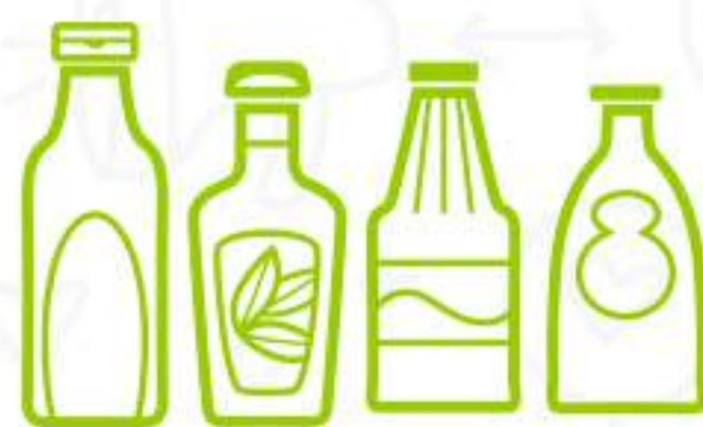
Sauces and Spices